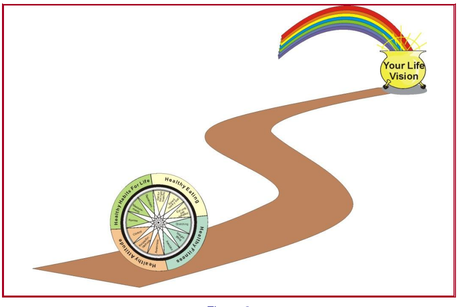
Figure 2 Road to Optimum Health

Think about what you want your life vision to be. Make it something that will continually draw you forward through the coming years. Write it down on a piece of paper and put it away in a safe place (not so safe that you forget where you put it!) Every so often you should look at it to see how you're doing in your pursuit of your vision.