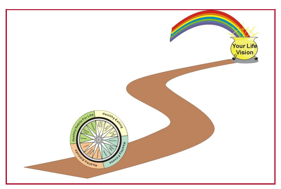
Figure 2 Road to Optimum Health

Think about what you want your life vision to be. Make it something that will continually draw you forward through the coming years. Write it down on a piece of paper and put it away in a safe place (not so safe that you forget where you put it!) Every so often you should look at it to see how you're doing in your pursuit of your vision.